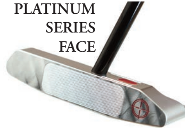
PLATINUM SERIES FACE